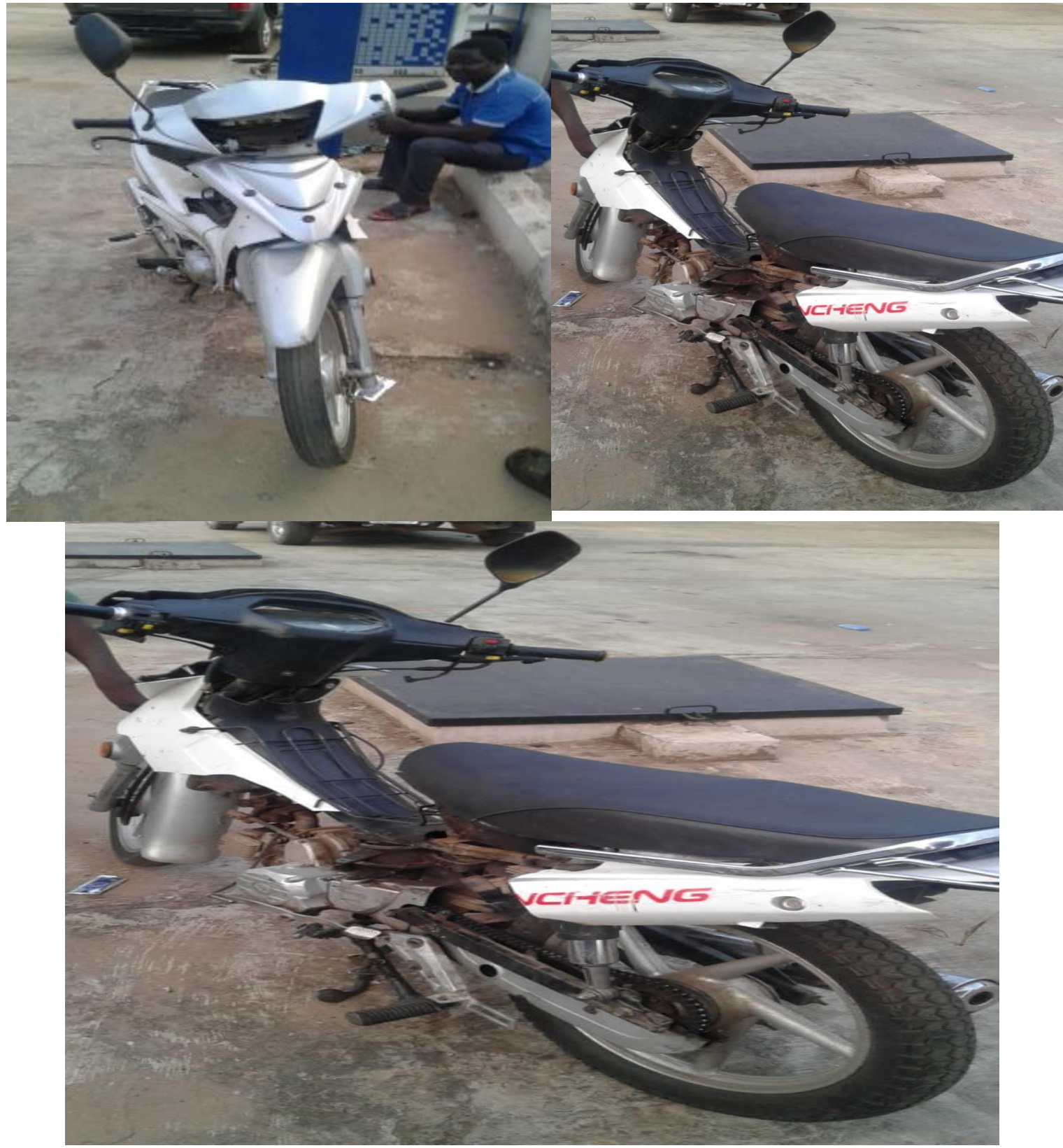
MISSION BIKE GOT DAMAGES